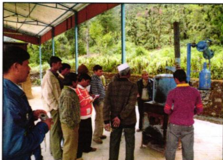
Farmers' training on distillation unit

Antimicrobial activity of Rauvolfia serpentina , Saussurea costus , Berberis asiatica , Swertia chirayita etc. were carried out against different bacterial strains such as Salmonella typhimurium , Escherichia coli , Citrobacter freundii , Proteus vulgaris , Enterococcus faecalis and Staphylococcus aureus . Among these species Rauvolfia serpentina showed significant antimicrobial activity.